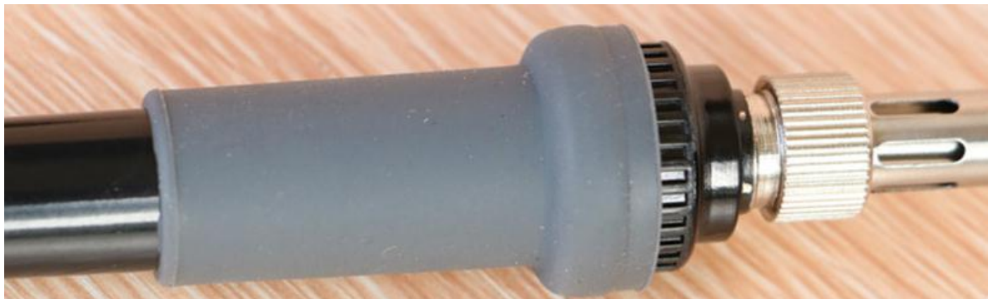
High temperature resistance silicon rubber hand grip