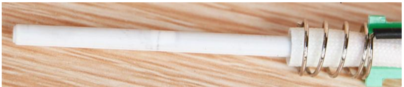
Long life Ceramic Heating Element