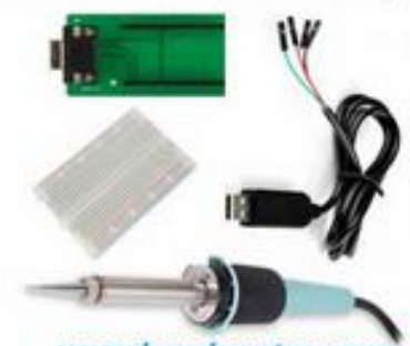
Tools & Accessory