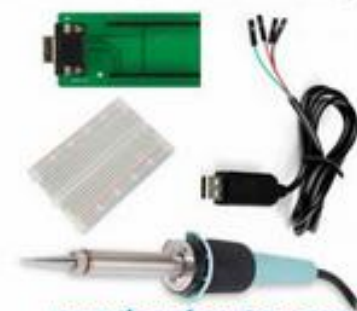
Tools & Accessory