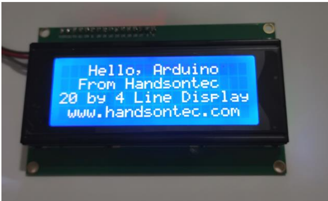
20 characters x 4 Lines Negative Transmissive Display