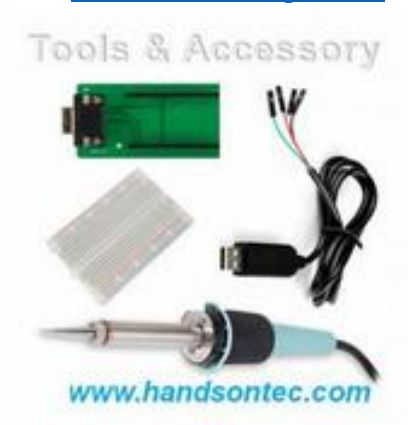
Tools & Accessory