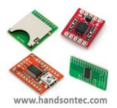
Breakout Boards & Modules

We keep adding the new parts so that you can get rolling on your next project.