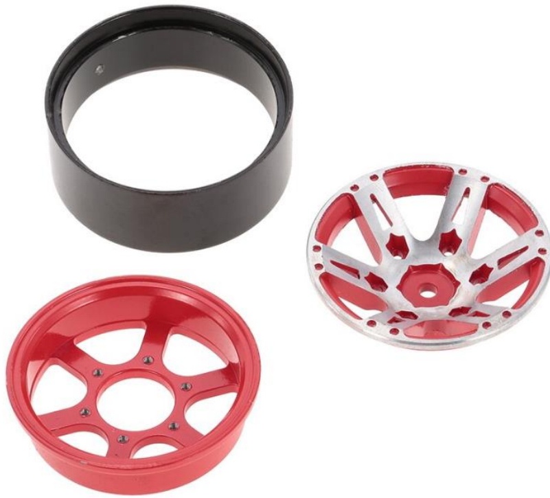
3-pieces all metal rim