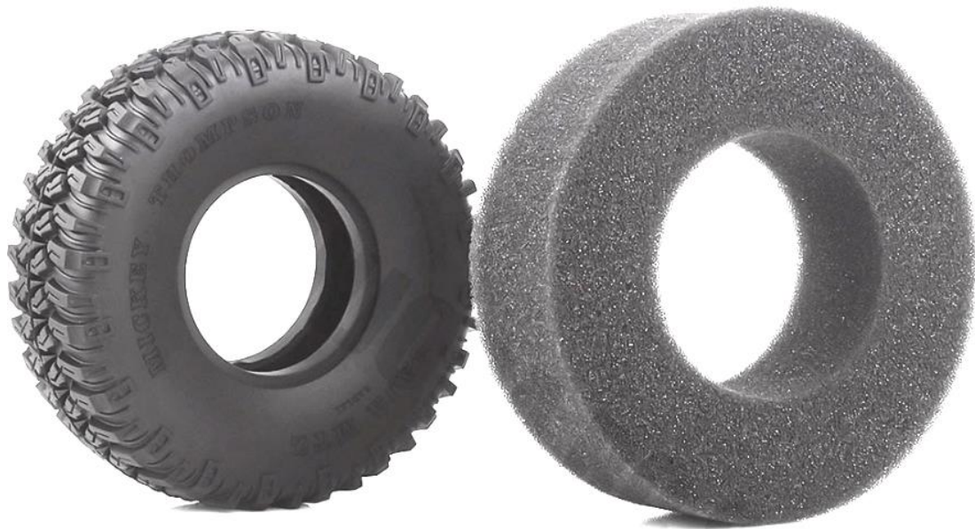
Rubber tyres with sponge